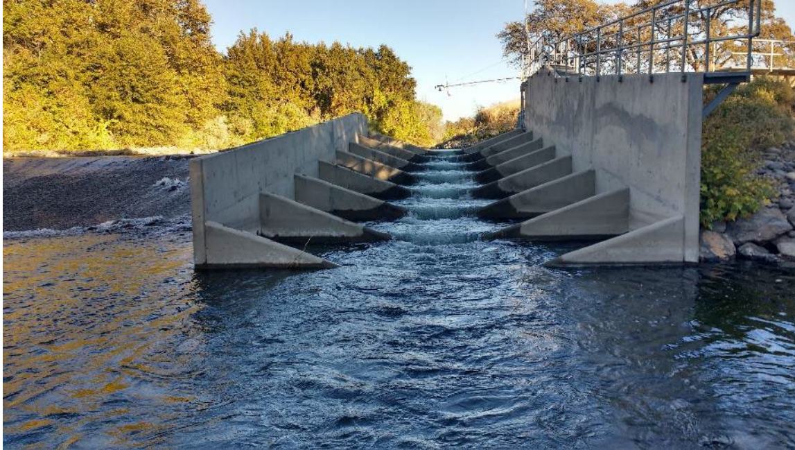
Figure 6. Ward Weir on lower Mill Creek with new lamprey-friendly fishway structure. Note weirs have rounded tops to provide lamprey climbing routes and are v-shaped to provide low velocity climbing routes at a range of streamflows. However, many other fish passage facilities in the Sacramento RMU do not provide lamprey friendly passage routes.