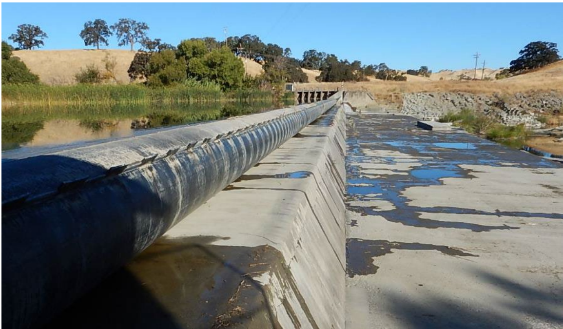
Figure 8. Capay Diversion Dam on lower Cache Creek. Capay Dam is one of several passage obstacles blocking Pacific Lamprey from historical habitat in Cache Creek.

Cache Creek flows out of Clear Lake and provides connectivity to that basin as well as the North Fork Cache Creek and Bear Creek drainages. The lower reaches of Cache Creek are seasonal and highly modified, but the upstream foothill habitats and potentially Clear Lake itself would provide suitable habitat. Access to upper Cache Creek is blocked by diversion structures in the Yolo Bypass (see mainstem Sacramento), the Cache Creek Settling Basin and Capay dam (Figure 8). Implementation projects for Cache Creek focus on passage through these structures that block the migration corridor into the upper drainage.