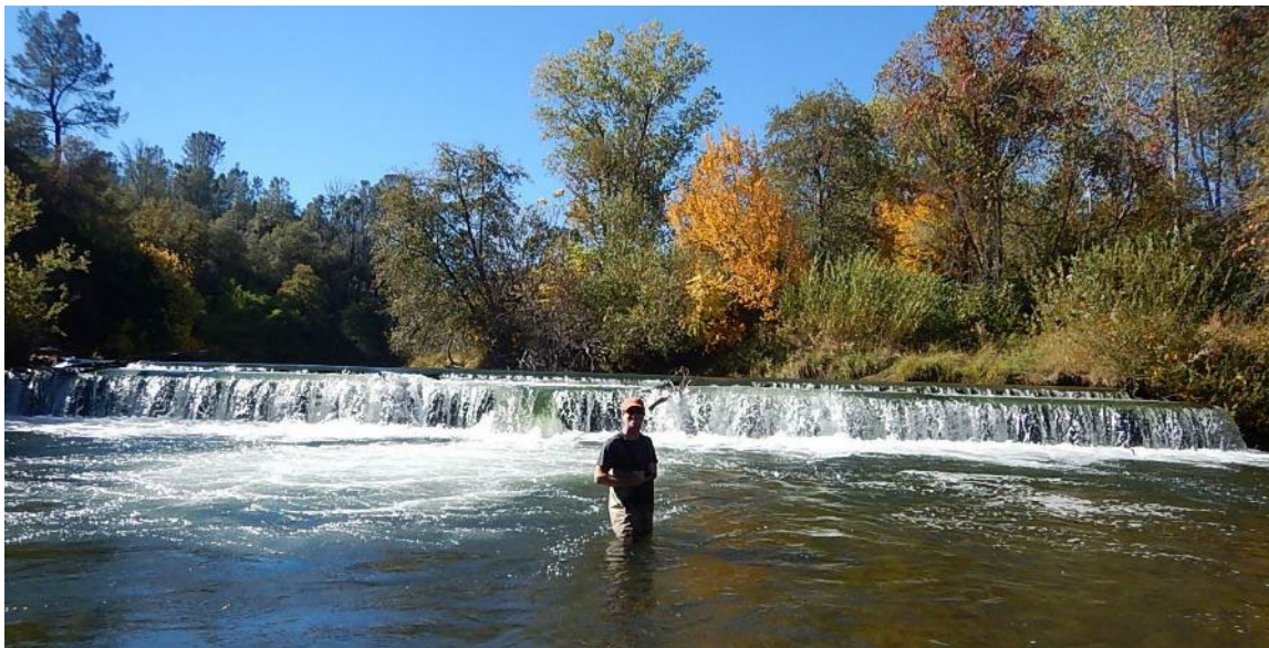
Figure 7. Sheetpile structure on lower Clear Creek to protect irrigation siphon below streambed. This structure may pose an obstacle to upstream lamprey migration and reduce their ability to reach upstream habitats.