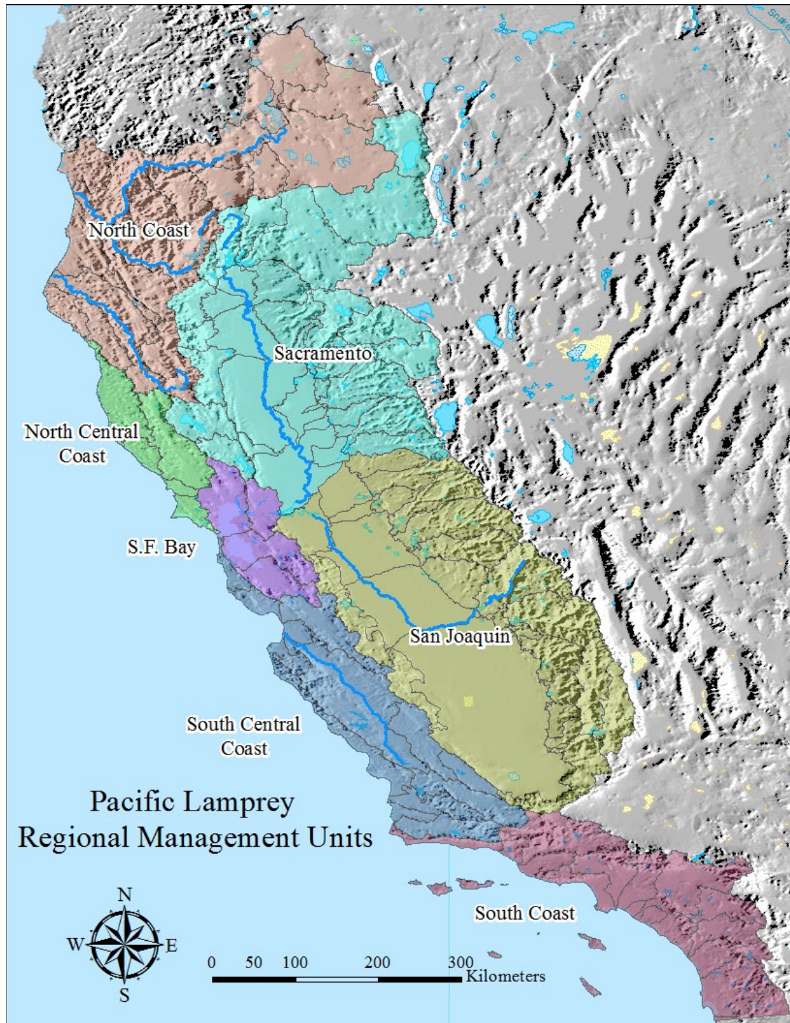
Figure 1. Map of seven California Regional Management Units (RMUs).