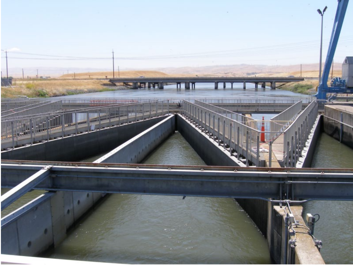
Figure 4. Entrainment at the Tracy Pumping Facility (USBR) and Clifton Court Forebay Diversion Facility (CDFW) in the lower San Joaquin potentially impact passage for large numbers of downstream migrating juveniles from both the San Joaquin and Sacramento drainages.