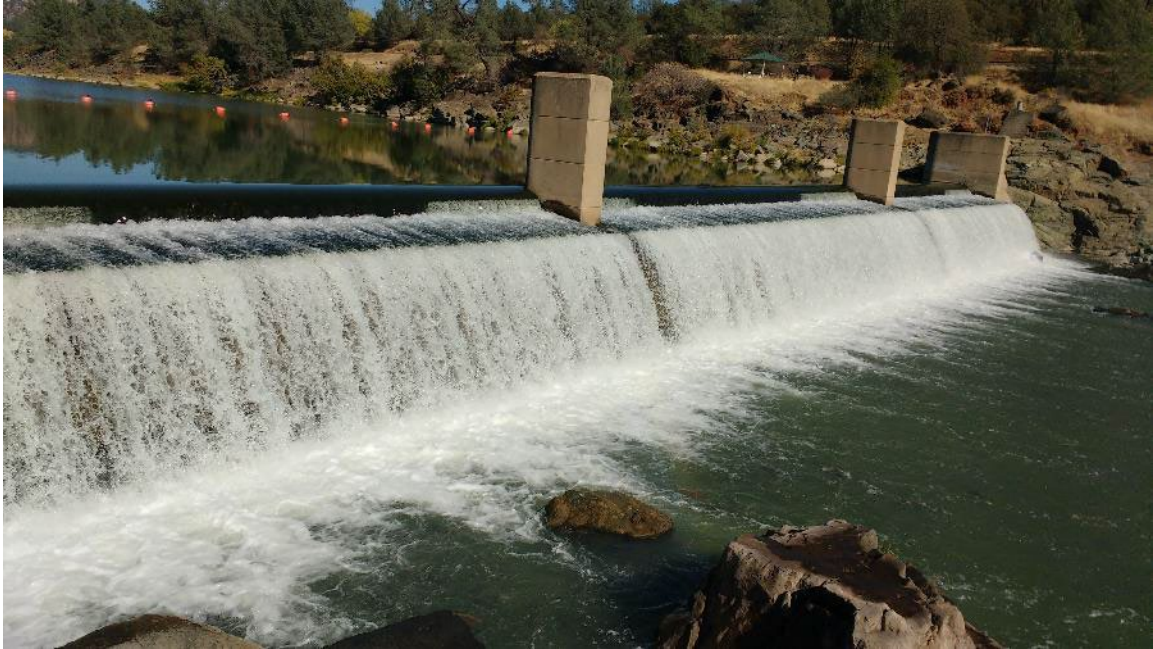
Figure 5. Fish Barrier Dam below Oroville Dam on the Feather River adjacent to the Feather River hatchery.