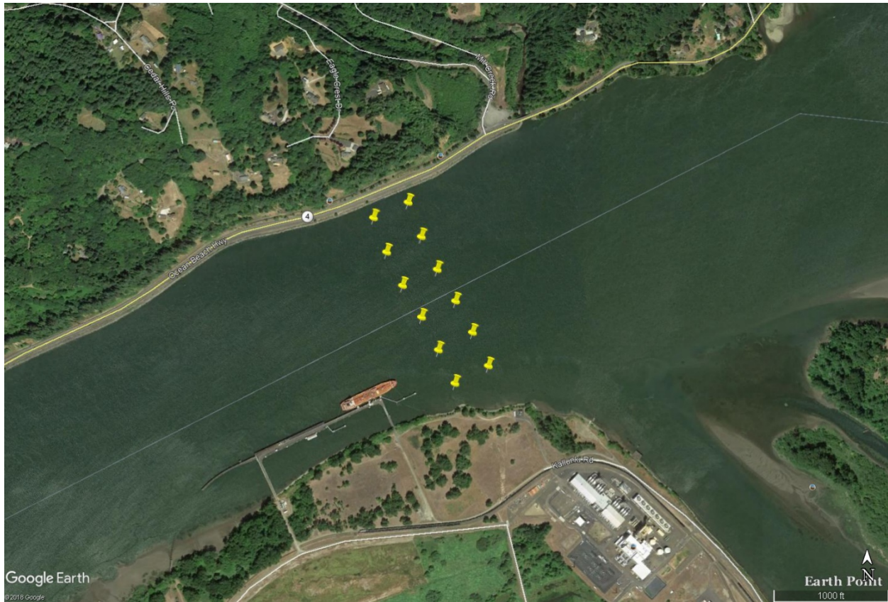
Figure 1. JSATS acoustic receiver array located on the Columbia River at RKM 86, between Oak Point on the north (Washington) shore and Port Westward on the south (Oregon) shore. Yellow pins designate individual acoustic receiver locations (12) which are spaced 96 m apart and 50 m from shore.