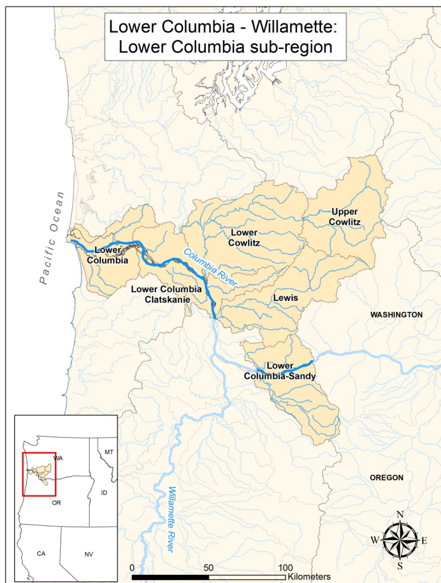
Figure 1. Map of watersheds within the Lower Columbia/Willamette RMU, Lower Columbia sub-unit.

The Lower Columbia River sub-unit within the Lower Columbia River/Willamette Regional Management Unit includes watersheds that drain into the Columbia River mainstem from Bonneville Dam at Rkm 235, west to confluence of the Columbia River with the Pacific Ocean. It is comprised of six 4 th field HUCs ranging in size from 1,753–3,756 km 2 (Table 1). Watersheds within the Lower Columbia River sub-unit include the Lower Columbia-Sandy, Lewis, Upper and Lower Cowlitz, Lower Columbia-Clatskanie, and Lower Columbia River (Figure 1).