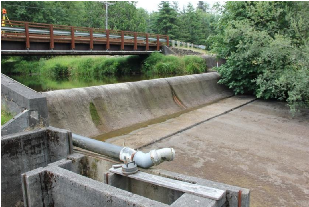
Barrier Dam at Klaskanine Fish Hatchery photographed July 13, 2018. Note that there is no flow over the barrier dam as all water is diverted through the hatchery resulting in no possible passage during lower flows.